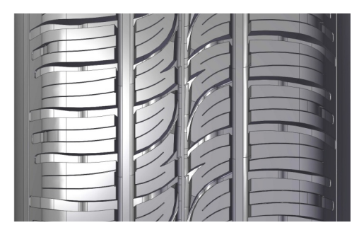
Tire width of 205 mm