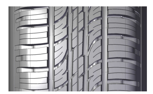
Tire width of 215 mm or more