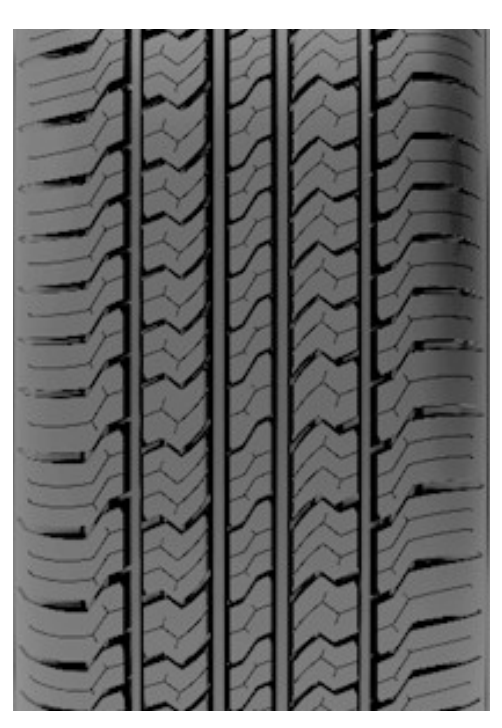
Single tread for all standard sizes

Bosco A/T model has two types of tread pattern - tires with a tread width of 215 mm or more have an additional central reinforcing rib.